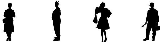
Neighborhood Captains (3-5 appointed per Precinct)