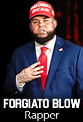
FORGIATO BLOW Rapper