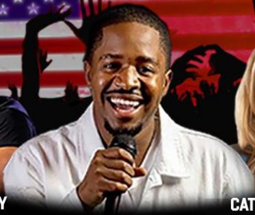
TERRENCE K WILLIAMS Comedian