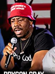
BYRYSON GRAY Rapper