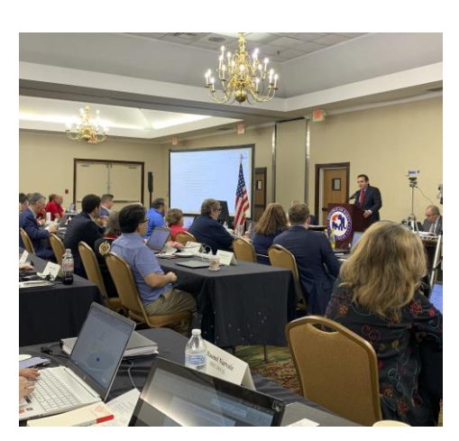
The SREC meeting of the whole on Sat.